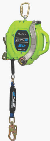
60' FT-R SRL-R